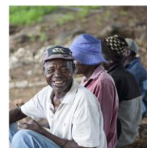
Older citizen monitoring: Achievements and learning

Older citizen monitoring is a social accountability tool and a process that promotes dialogue between older people, civil society organisations, governments and service providers.